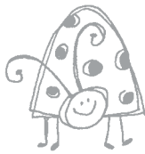
Bug me anytime.