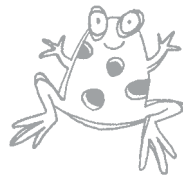
Hoppy for you!