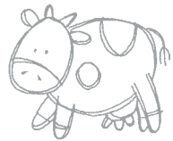
Like no udder