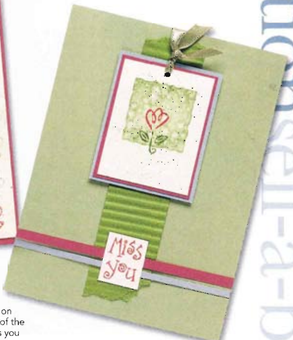
Scrapbook page uses Alphablocks set found on page 167 and Itty Bitty Backgrounds set found on page 122; tea card uses Many Thanks set found on page 161 and Little Shapes set found on page 143 of the Stampin' Up! 2001-2002 Idea Book & Catalog. Miss you card also uses Little Shapes set.